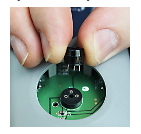
Figure 2. Installing the Sensor